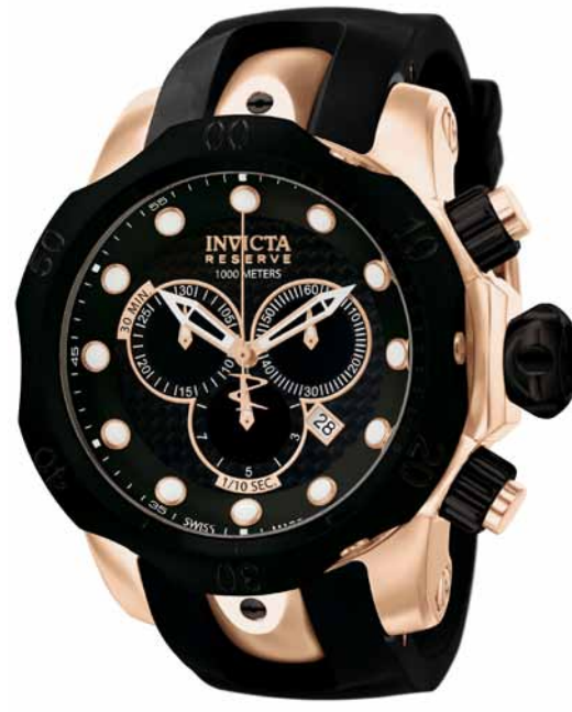
The Invicta Reserve Subaqua Venom