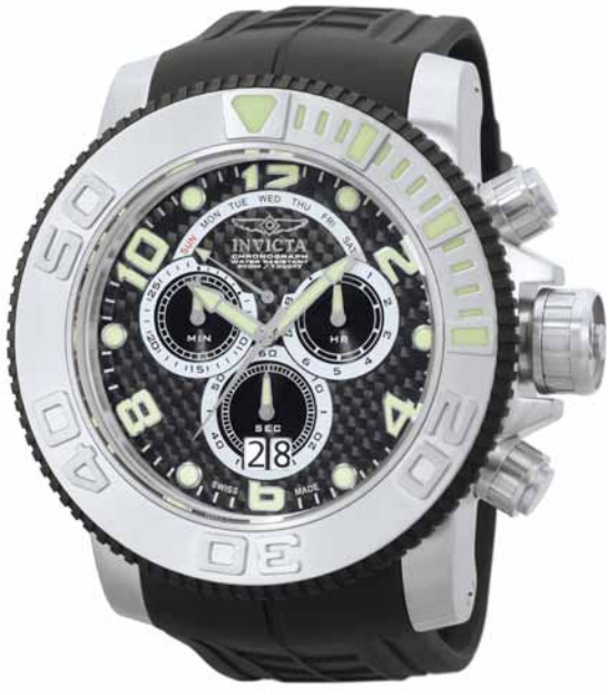
The Invicta Pro Diver Sea Hunter