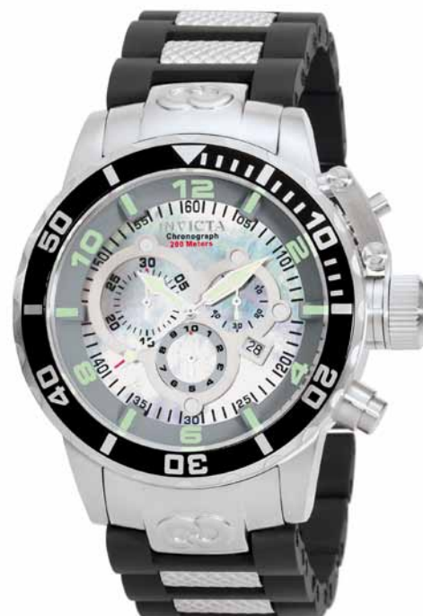
The Invicta Corduba Swiss Chrono