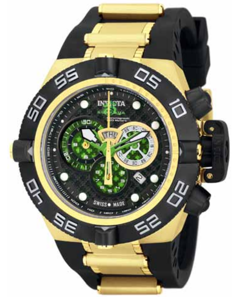
The Invicta Subaqua Noma IV