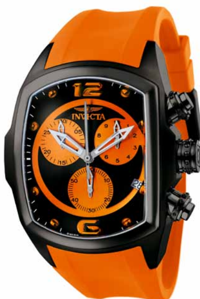
The Invicta Lupah Revolution