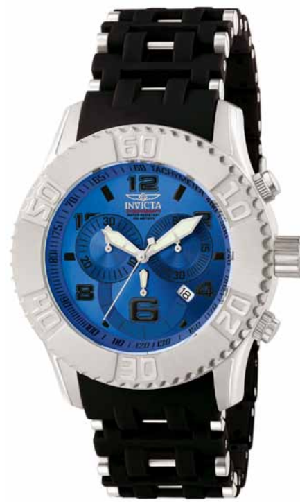
The Invicta Sea Spider Chrono