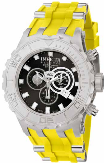
The Invicta Reserve Ocean Reef