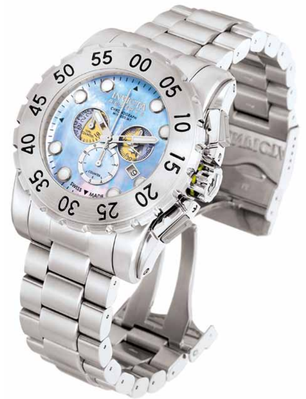
The Invicta Reserve Leviathan