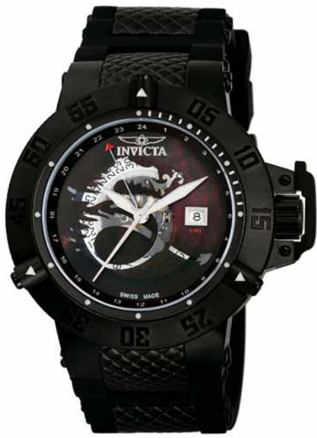
The Invicta Subaqua Dragon