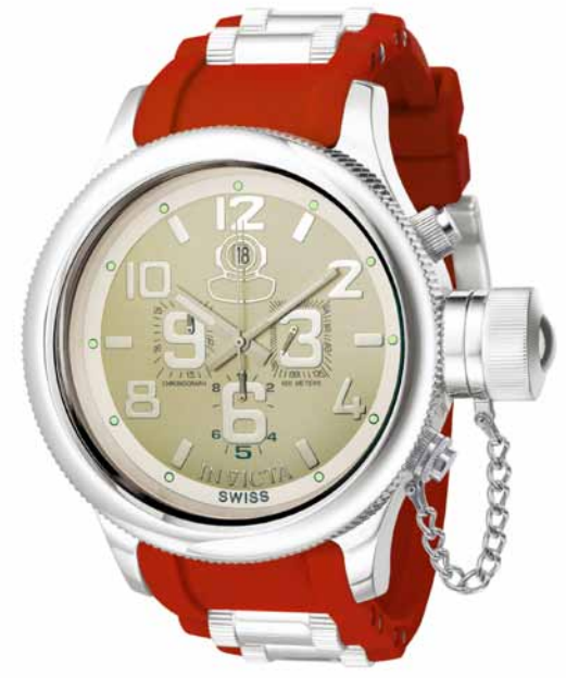
The Invicta Russian Diver