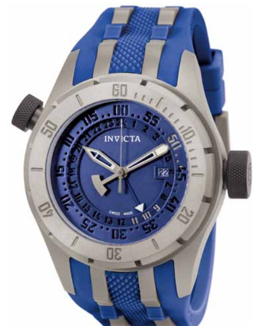
The Invicta Coalition Forces GMT