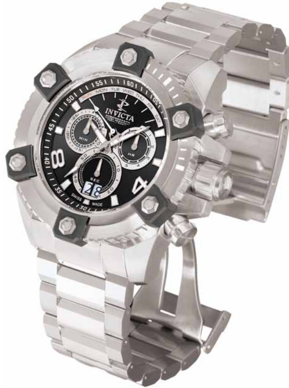
The Invicta Reserve Arsenal II